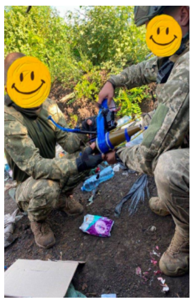
Ukrainian soldiers attaching RPG warhead to a FPV drone

Most popular and well known Ukraine FPV drone manufacturers are TORO and Escadrone