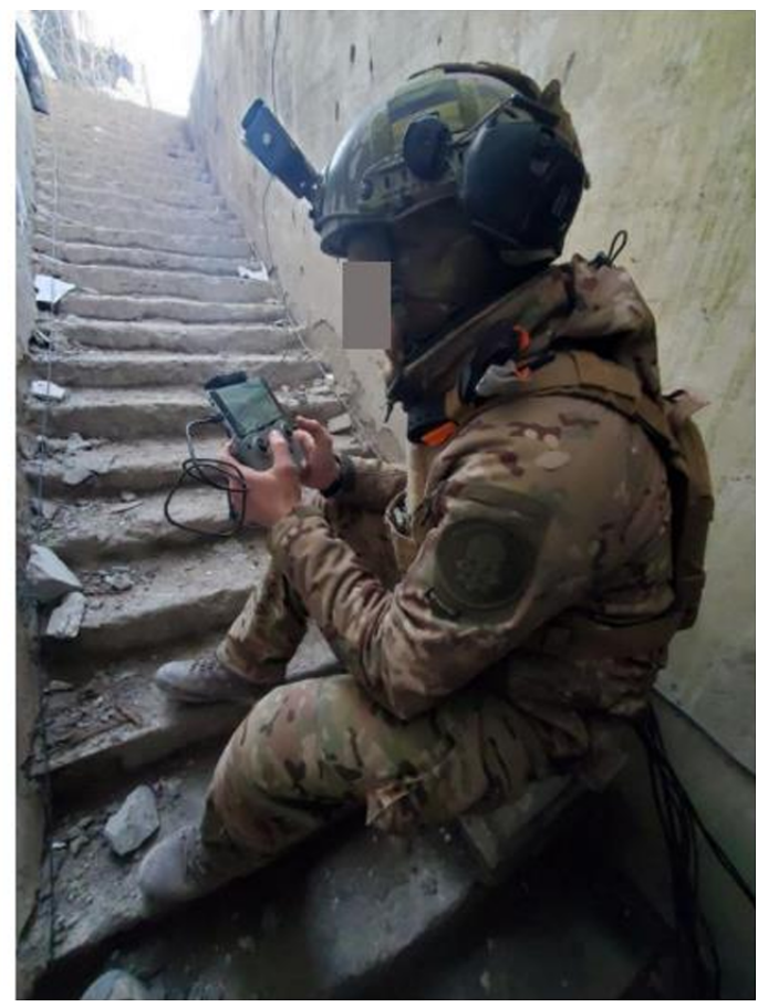
External antennas boost signal and allow drone pilots to fly from shelter