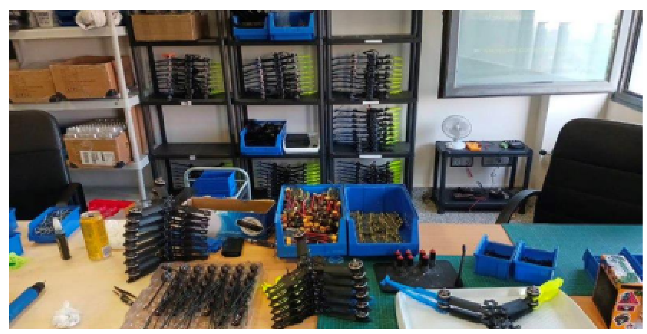
FPV drone manufacturing workshop in Ukraine